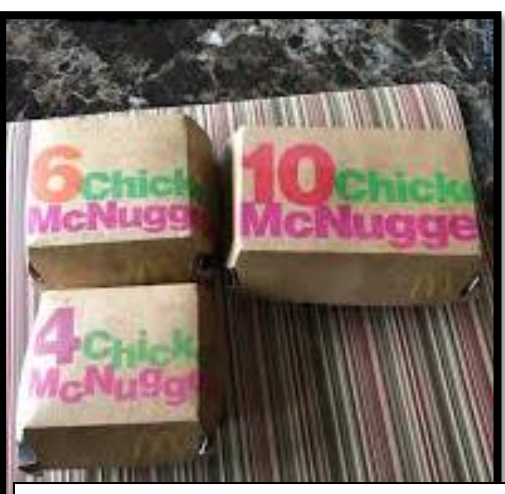
Sam got a box of 6, a box of 10 and a box of 4.