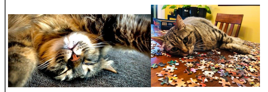
Day 2: Mrs. Gollob has 2 cats, their names are Bella and Stripes.

Use pictures, words and numbers to explain your thinking.